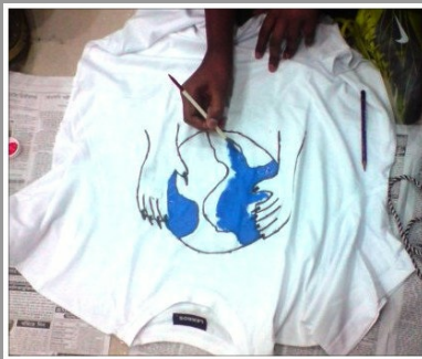
SPEED Youth students painting their own T-shirts in the Arts festival