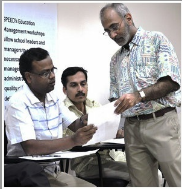
Students are paid individual attention in our English Language training session.

Syeda Madiha Mursheed conducting Professional development workshop with BSC members